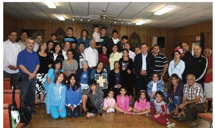
Almanarah's group camp.

Join with us in prayers, that God may give us, according to God's timing, a home church so that we may grow abundantly. Please also pray that we will succeed in sharing the message of salvation and hope to the thousands who live in London.