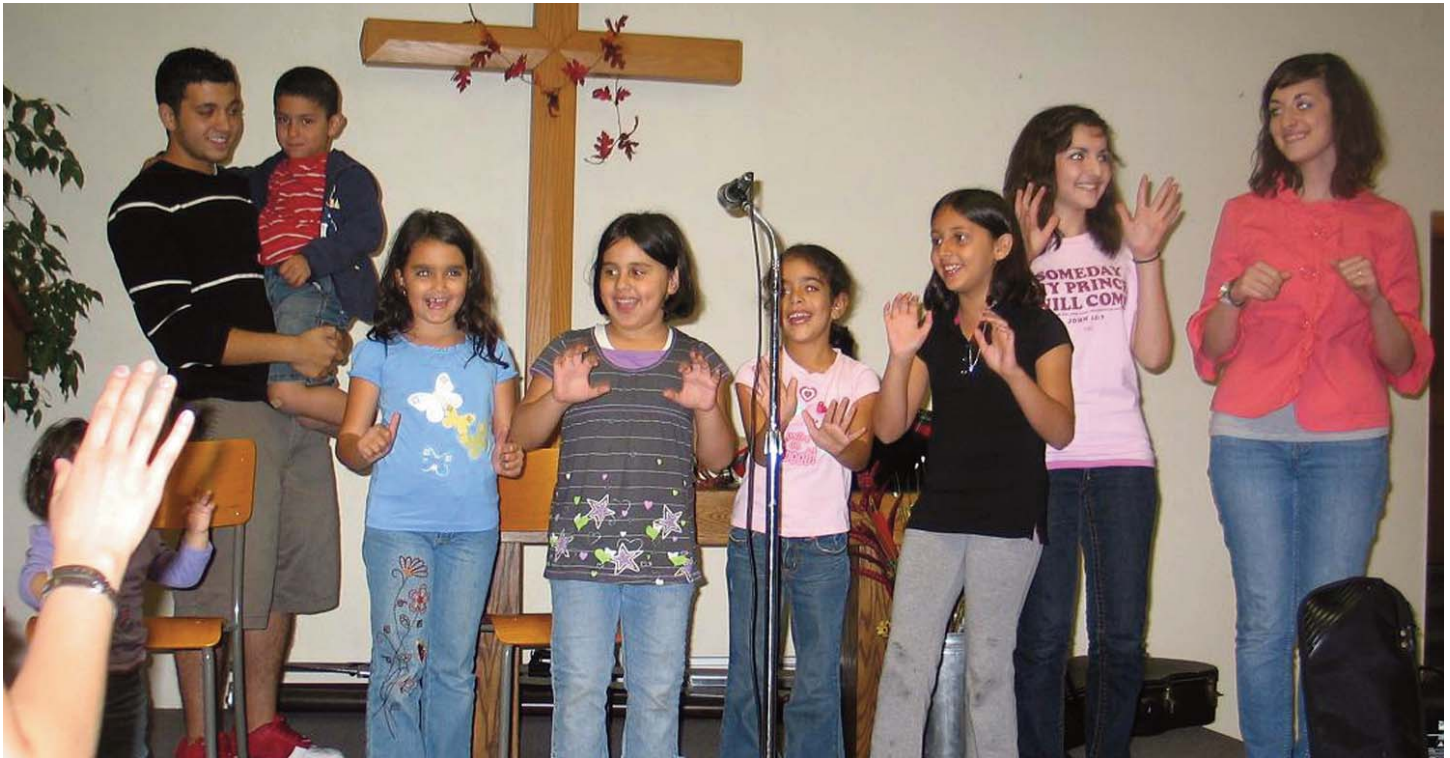
Children and youth leading worship at Almanarah Presbyterian Church, London, Ontario.

Presbyterians Sharing is the national fund supporting the mission and ministry of The Presbyterian Church in Canada.